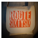
Messenger Bags $19.99