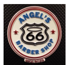
Angel's Barber Shop Rubber Magnet $5.99