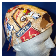
"Route 66 Signs" or "Scenic 66"