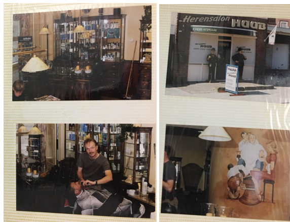
Photos of Huub's Hair Salon in The Netherlands