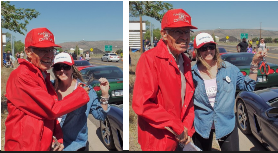
Angel's Impromptu Haircut