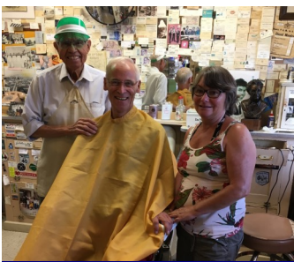
The Surprise Birthday Haircut