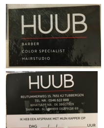
Huub's New Business Card: Back and Front