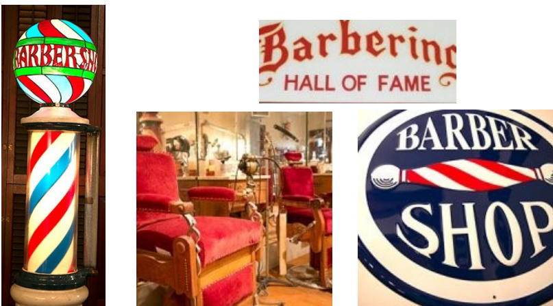
Above: Images from The National Barber Museum and Hall of Fame